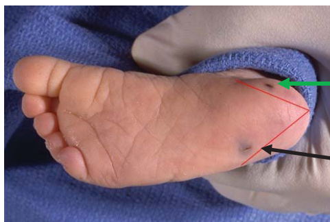
Heelstick puncture areas